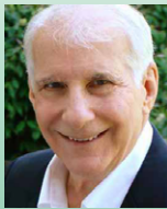
Dr. Peter Breggin